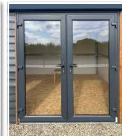
FRENCH DOORS €1000 Full Glass