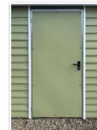
INSULATED SINGLE DOOR €200