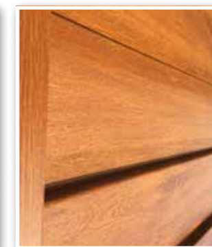
WOOD GRAIN CLADDING