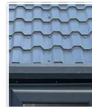
TILE STYLE ROOF