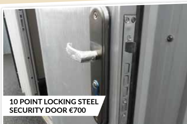
10 POINT LOCKING STEEL SECURITY DOOR €700