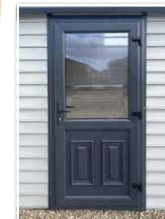
SINGLE PVC DOOR €700 Slate, White or Woodgrain