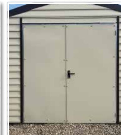
INSULATED DOUBLE DOORS €450