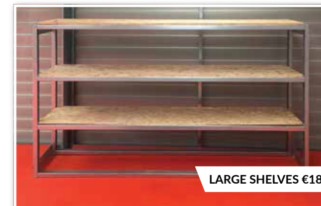
LARGE SHELVES €180